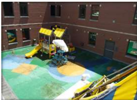
Play area prior to renovation.

The ETC opened in May of 2011 and provides holistic healing through the use of the creative and expressive arts. Expressive therapy is not a new concept: but by offering a completely dedicated space in a hospital setting, is an innovative idea unique to Akron Children's Hospital. The ETC is designed for patients, families, staff, and the community with the purpose of providing holistic healing through the arts. Currently, the ETC offers music therapy, art therapy, creative writing, and many other artist-in-residence style programming opportunities open to patients, families, and staff.